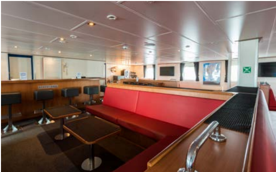
Bar & Observation lounge